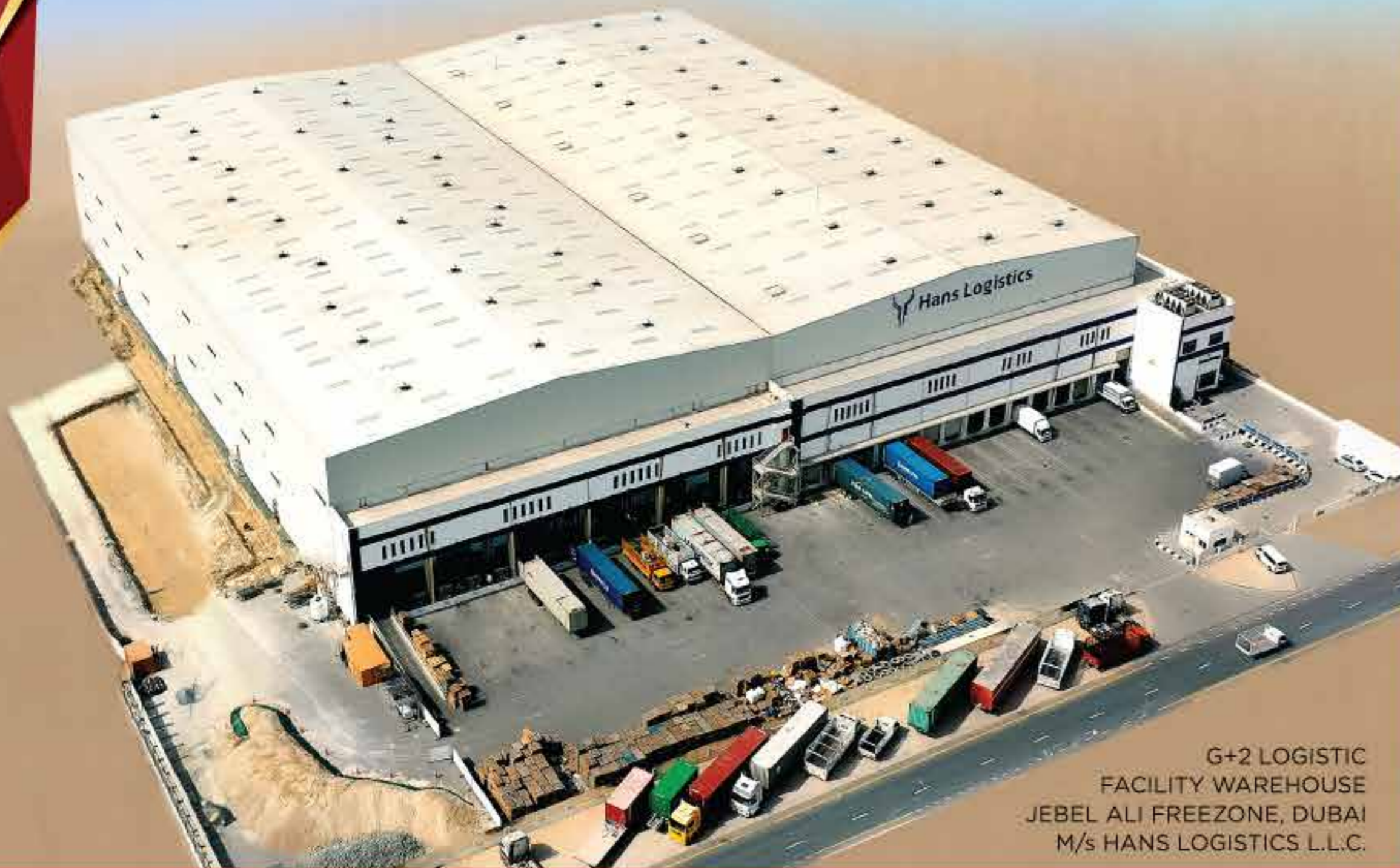
G+2 LOGISTIC FACILITY WAREHOUSE JEBEL ALI FREEZONE, DUBAI M/s HANS LOGISTICS L.L.C.